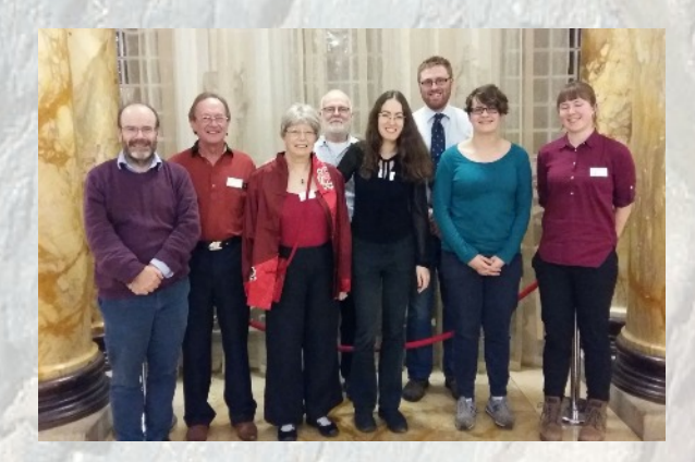
Team TW:eed at the PalAss AGM