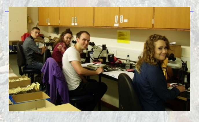
Leicester Volunteers, copyright Carys Bennett, 2015

During the month the volunteers learnt how to process and sieve samples, pick for microfossils, identify specimens and image them on the Scanning Electron Microscope (SEM). They also had time to examine some of the rock samples from our recent excavation at Chirnside, discovering many fossils such as ostracods, bivalves, fish material and bones. This is helping to shed further light on the environments in which the tetrapods lived and which animals and plants they lived alongside.